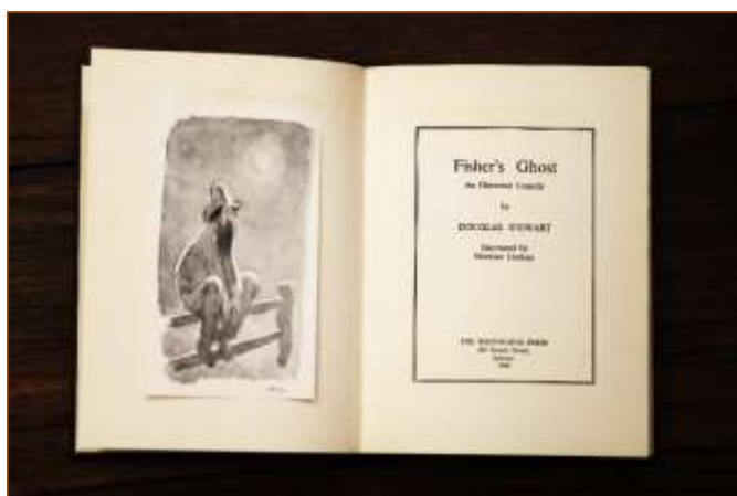
Fisher's Ghost: An Historical Comedy by Douglas Stewart (1960)